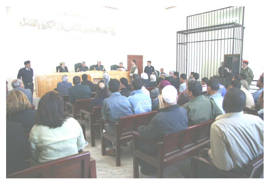
In January 2005, the General People's Congress abolished Libya's extraordinary court, the People's Court, which had heard most political and security cases and was notorious for politically motivated judgments and biased trials. Cases under the court's review at the time of its closure were transferred to regular criminal courts, like this Court of Appeals in Benghazi.

"We couldn't even see the file in cases before the People's Court," one lawyer told Human Rights Watch. "The law didn't ban us, but it was the procedures of the authorities, which were arbitrary and depended on their mood."<sup>34</sup>