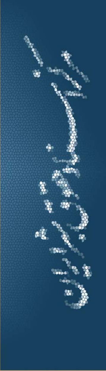
Silencing the Women's Rights Movement in Iran