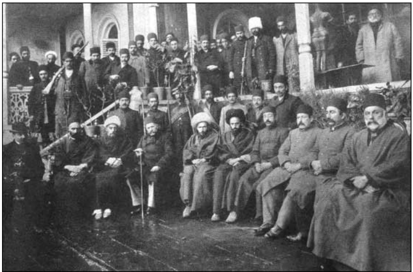
Photo: A nationalist council at Rasht during the constitutional revolution

From time immemorial rural communities in Iran have organised cooperative ways of managing the two big threats they faced: the scarcity of water supplies on the Iranian plateau and oppression by despotic and arbitrary rulers, bandits, and invaders.<sup>31</sup> Until the end of the 19th century, the central government had little direct influence on the lives of ordinary citizens, but growing dissatisfaction with the despotic, corrupt, and negligent rule of the Qajar kings led to a series of revolts around the country at the turn of the 20th century. Associations of reformers, merchants, and Freemasons played a major role in the Constitutional Revolution of 1905–11, alongside leading clerics who wanted to re-establish Iran as a strong Shiite state. In 1906, for the first time, the king was forced to accept a constitution ensuring the equality of all before the law and a national assembly to share power with the king.