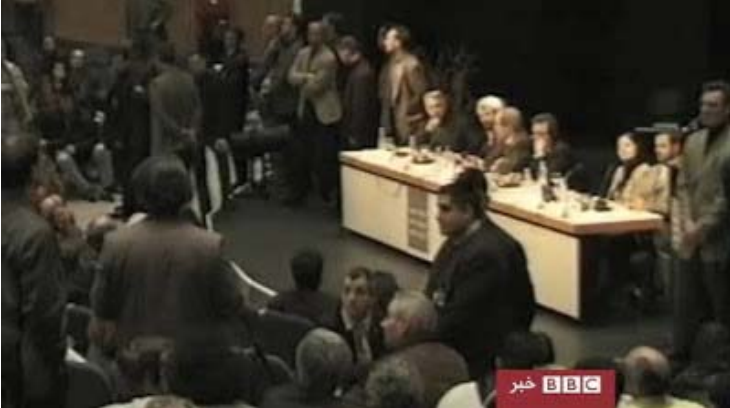
Figure 4 Eshkevari's participation in the Berlin conference in April 2000 was the basis for his arrest after he returned to Iran. Second from the left at the table, Eshkevari can be seen participating in a panel discussion in the Berlin conference.

Turning to Eshkevari's alleged repudiation of Islamic precepts, the indictment quoted Eshkevari as saying that virtually all Islamic laws are "social laws," and, as such, they are subject to change, even if they have been mentioned in the Qur'an.<sup>115</sup> In particular, Eshkevari had allegedly included "eternal" Islamic laws such as the veiling of women, the amputation of a thief's hand, judgeship of women and inheritance laws among provisions that could be changed. The indictment quoted Eshkevari as saying that Islamic laws revealed to Prophet Mohammad were not meant to be eternal, but that they were revealed to solve a particular issue at the time.<sup>116</sup> "If these [laws] are mutable, what remains of Islam, which, according to the Qur'an's text, it was supposed to be the most perfect religion, and its permissible and prohibited acts were supposed to be immutable until the Judgment Day? Is this not denying religious laws?"<sup>117</sup>