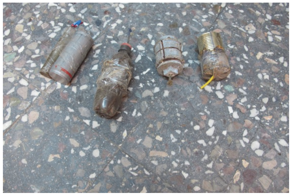
Improvised explosive devices seized by Military Intelligence in Homs.