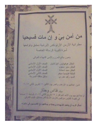
Death announcement.