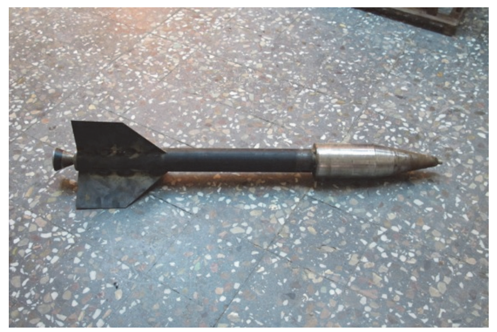
Locally produced rocket seized by Military Intelligence in Homs.