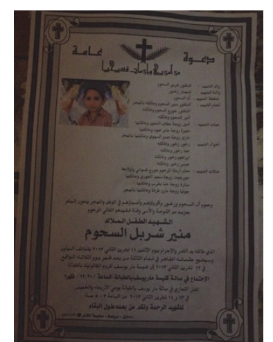
Munir al-Suhoom's death announcement.