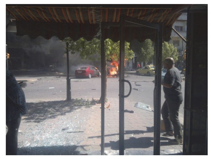
The aftermath of the second bombing.

The second explosion, which happened minutes later near an