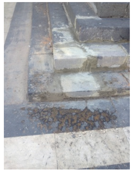
Hijaz train station, damage from November 6, 2013 explosion.