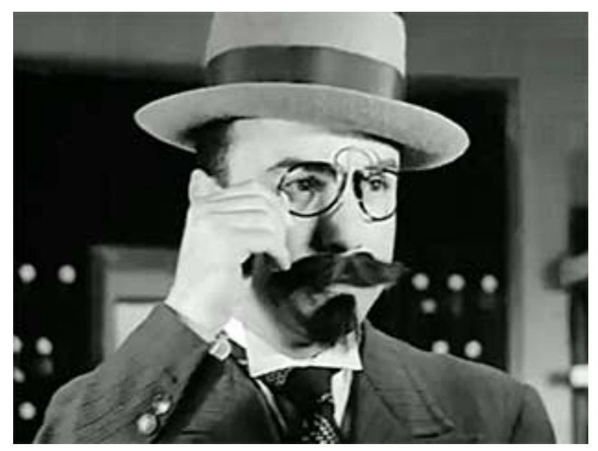
Figure 5.2. Hilmy disguised as Dr. Hilmy. Screenshot, Doctor Farahat (1935).