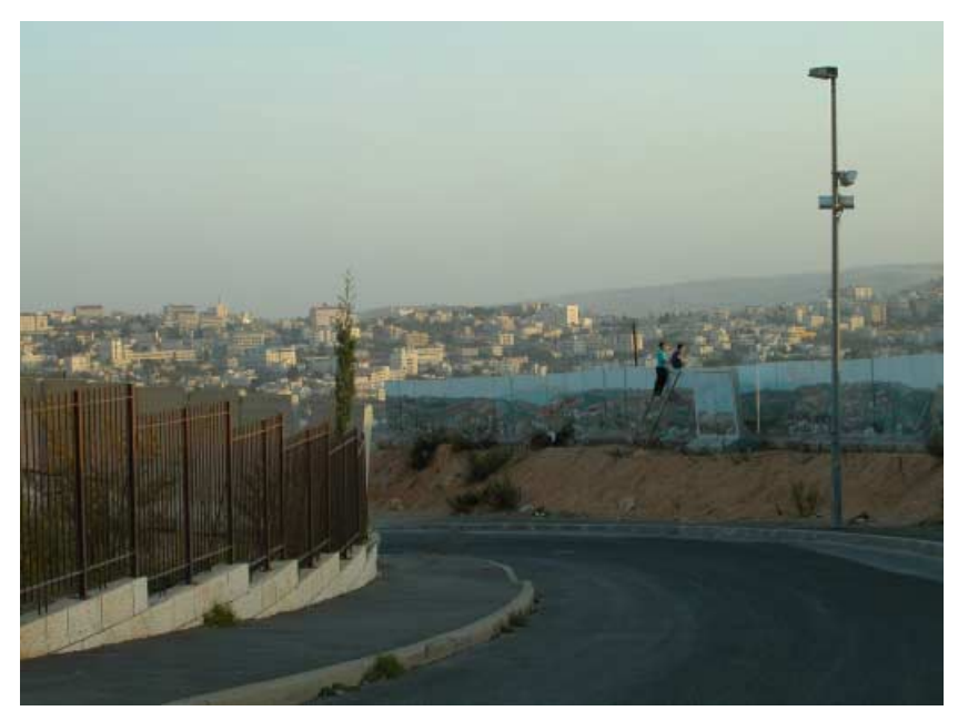
Figure 9.2. East Jerusalem.

suggest, however, that such a pragmatic approach to living together may form the basis for a politics beyond the communitarian, based on socioeconomic rights and an equality of spaces. This vision of justice is based not on control of institutions but on spatial contiguity and social respect on the neighborhood scale. From a sociological perspective, it is not improbable that ordinary politics may make it possible to achieve a more equitable city. It requires that violence disappear so that democracy can take its place.