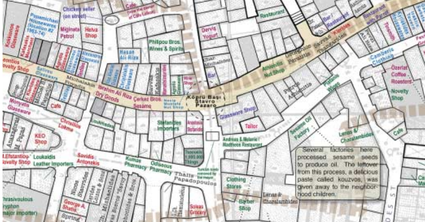
Figure 4.2. A portion of the map created through discussions and mapping sessions with the shopkeepers. Köprü Başı / Stavro Pazaro was a major landmark in the city and many shopkeepers were able to recall shops that once were located in this part of the city.