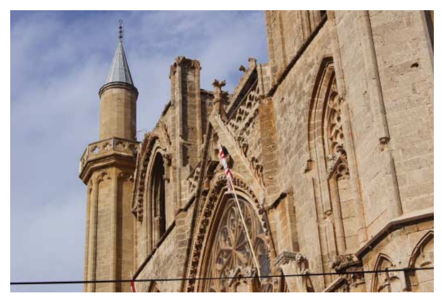
Figure 2.1. Minaret on the fourteenth century St. Nicholas Church in Famagusta, Cyprus, converted into a mosque after the Ottoman conquest in the sixteenth century. Aya Sofya mosque until 1954, then renamed Lala Mustafa Paşa Mosque.

marked by replacing the dominance of Muslim structures by dominant Christian ones.