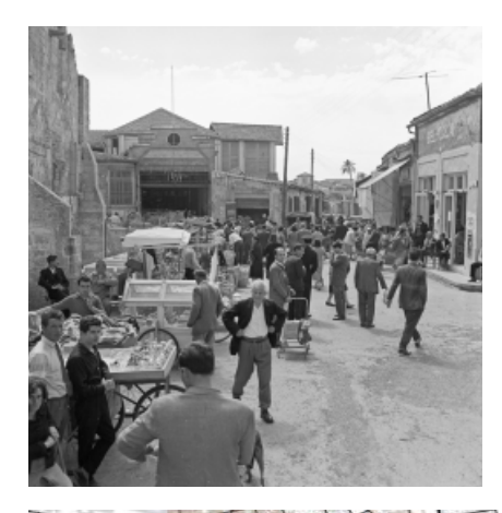
Figure 4.1. "View Near St. Sophia - Late 1950s." The main municipal market Pantapolio/Bandabulya appears in the background.