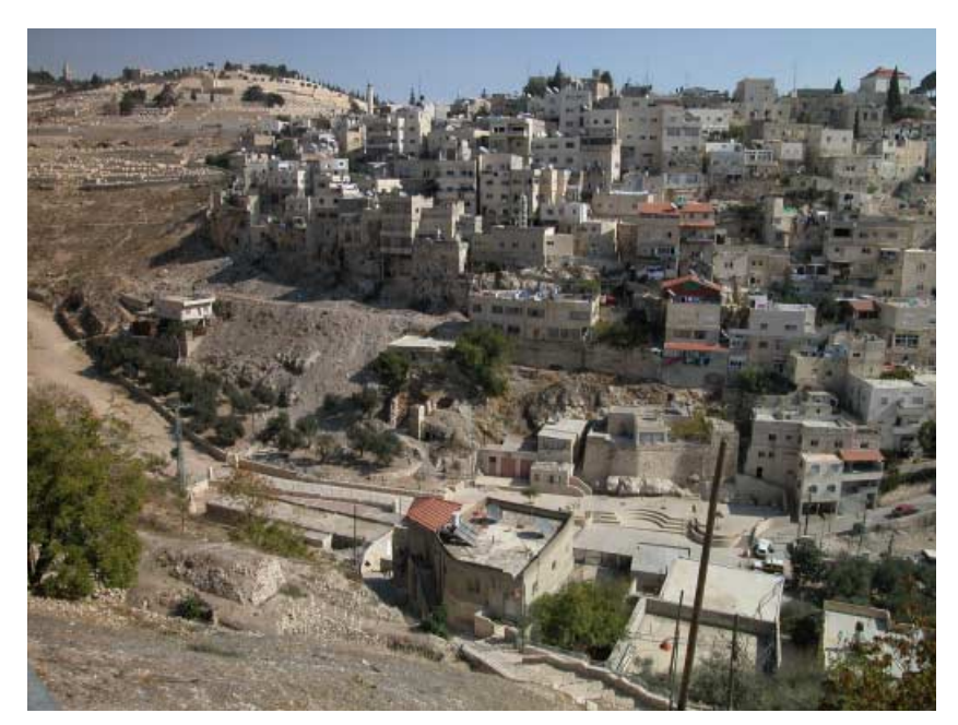
Figure 9.1. Confrontation in Jerusalem: Mt. of Olives and East Jerusalem.

ders and walls. Without discounting the real constraints that have been created by the wall and its limits, this approach also considers subtle interactions between segmented populations (Israeli and Palestinian, Jewish and Arab) and the ways in which these interactions shape links between these social worlds. We will thus highlight examples of acts of communication and the mechanisms actors use to continue exchange at the edges of Jerusalem and between Jerusalem and the Palestinian territories. These operations may seem improbable or minor. But is it possible to find a model of balanced justice that assumes this state of facts, and the possibility of exchanging within a space that is fragmented and conflictual? Does not the vision of a politics of co-presence offer an alternative to theories and abstract political scenarios in the search for a solution to the spatial and inter-community conflict of Jerusalem?